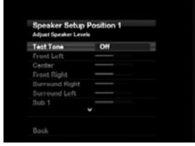
Figure 32 — Adjust Speaker Levels Menu

Press the AVR Settings Button to display the menu system, and then navigate to the Speaker Setup line. Press the OK Button to display the Speaker Setup menu. Select Setup Listening Position 1 (AVR 760, AVR 660) or 2 (AVR 760), press the OK Button, and then navigate to the Level Adjust line. Press the OK Button to display the Adjust Speaker Levels menu. See Figure 32.